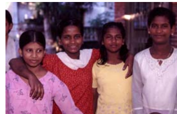
Children write a letter to their friend, prompting her return to Shraddha Bhaban

letter with tears in her eyes and decided to come back and commit to her education. It was a touching afternoon for all concerned. The women and children at Shraddha Bhaban are in fact one big family.