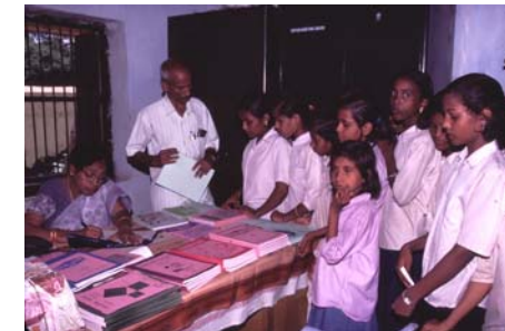
Children line up at Mahu High School to get the new textbooks that they have not been able to afford. Grassroots Asia provides free books and scholarships to the poor