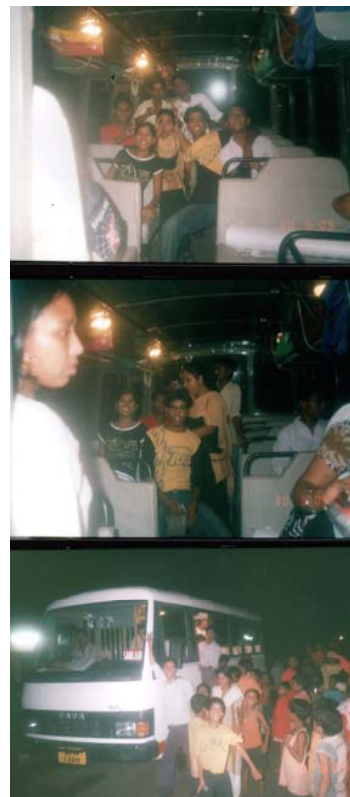
School bus that transports hundreds of children from the red light districts of Kolkata to youth centers, medical care and vocational training

Grassroots Asia and Sanlaap also purchased a school bus in 2005 which is used to serve 14 red light districts in Kolkata. The school bus provides hundreds of children, teens and young adults with transportation to care centers and vocational training.