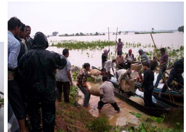
Several bridges collapsed, flooding hundreds of villages. Many were cut off from supplies and aid workers struggled to get boats into the remote areas.